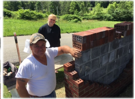
Local CPMA Work Day